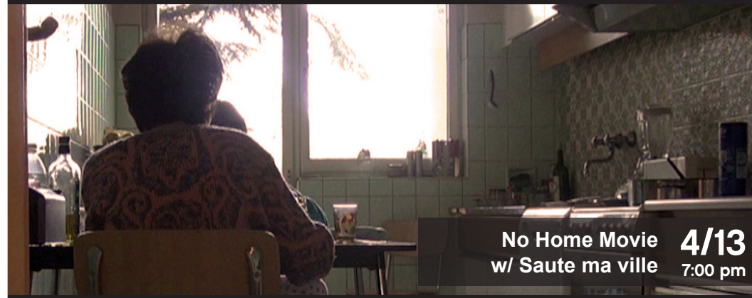
No Home Movie w/ Saute ma ville 4/13 7:00 pm