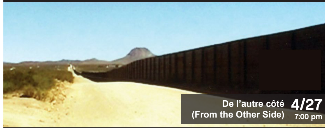
De l'autre côté 4/27 (From the Other Side) 7:00 pm